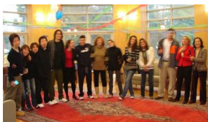
ELI Students and Teachers Singing Karaoke

ELI students and teachers gathered for a holiday party before the winter break. They had a "Yankee Swap" gift exchange, enjoyed singing karaoke holiday and popular songs, and had the chance to taste a traditional Yule Log cake. The highlight of the party was a rendition of "Rudolph the Red-Nosed Reindeer" sung in English, Spanish, and Japanese.